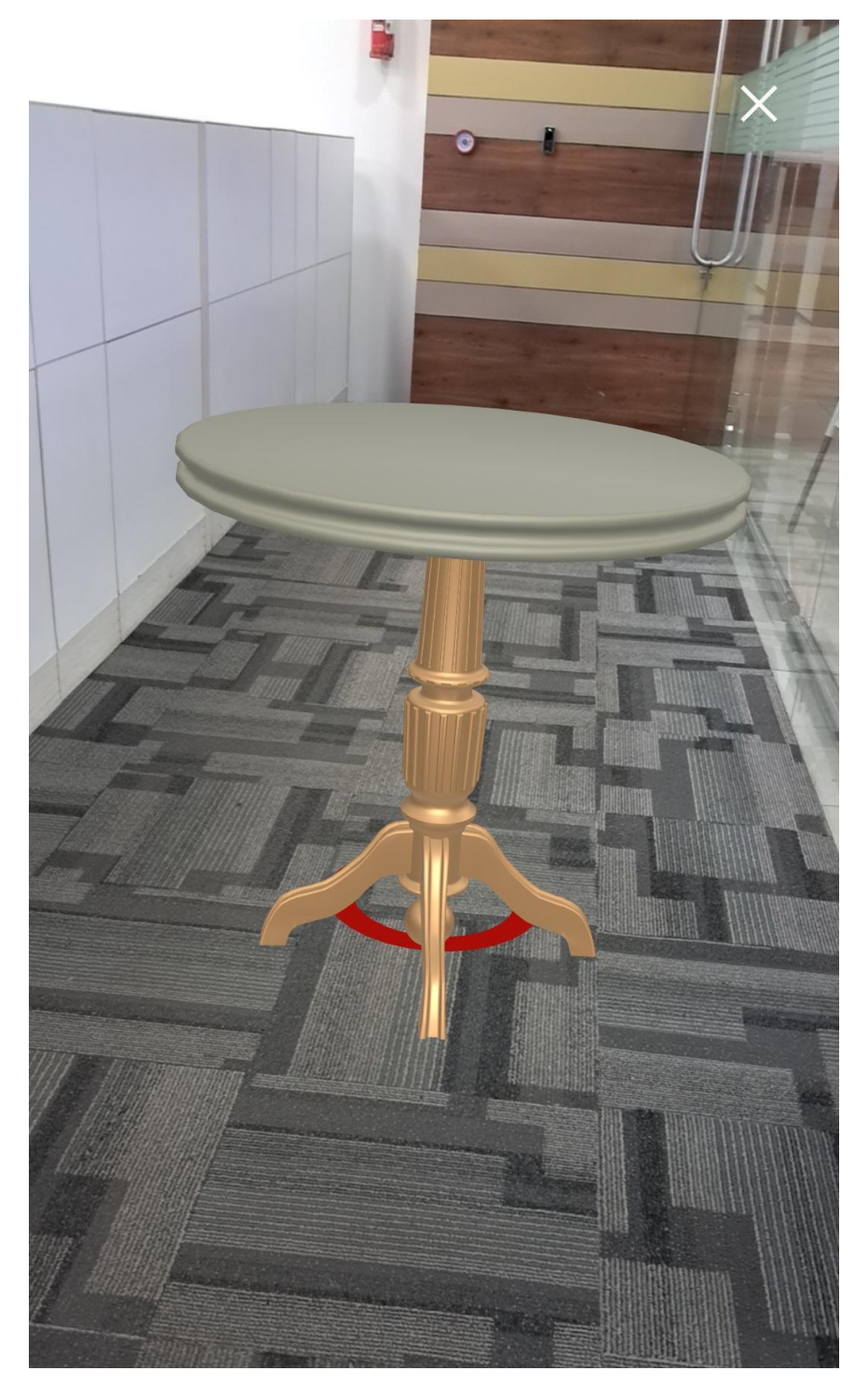
Figure 5: AR Product View

Note: This extension supports only simple and configurable products and its child products. Also, please add the 3D file with coordinates set to (0,0,0) for a better view.