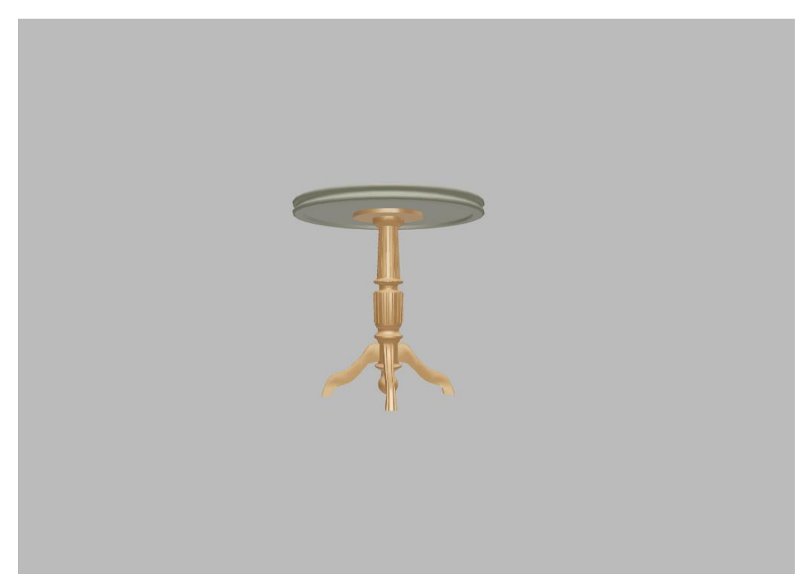
Figure 4: 3D Product View Popup